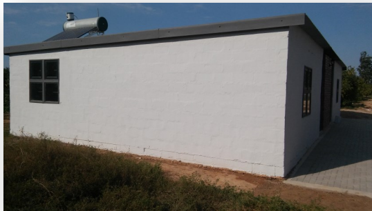
Below left —The eating area

At Siyathemba farm, a new hostel has been built for the seasonal pickers which can accommodate 18 people, as seen below and is now being used for the first time.