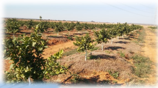
(right) Phase 2