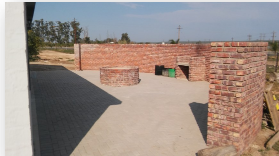
Below right—The kitchen