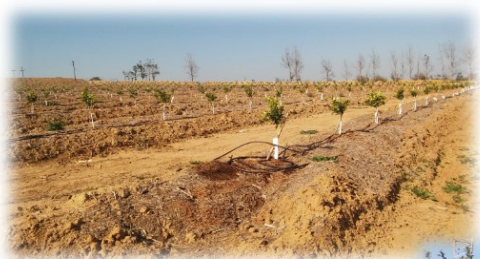
(right) Phase 1